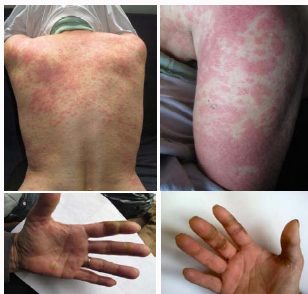
Figure 2: Case 2 : Skin toxicity on sorafenib initiation after nivolumab treatment with skin rash and "hand and foot syndrome".

The recently developed anti-PD-1 nivolumab (BMS-936558) increases survival and helps to reverse the exhausted phenotype of T cells expressing PD-1 and has shown promise as second- or higher-line therapy in patients with advanced non-small-cell lung cancer, melanoma and RCC [8]. PD-1 is a key immune checkpoint receptor that is expressed by activated T-cells and mediates immunosuppression. It functions mainly in peripheral tissues when T-cells encounter immunosuppressive PD-1 ligands (PD-L1 (B7-H1) and PD-L2 (B7-DC)) expressed by tumor and/or stromal cells. In