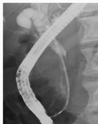
Figure 4: We inserted 8Fr delivery system into the common bile duct.

obstruction. For patients having advanced malignant tumor, metal stent placement may be preferred compared with plastic stent because stent patency may be longer. Kitano et al [4] conducted comparison study between FCSEMS and UCSEMS placement for patients complicated with distal malignant biliary obstruction. According to this study, stent patency was significantly longer in FCSEMS than in the UCSEMS (mean±s.d.: 291.3±159.1 vs 166.9±124.9 days; P=0.047 ). Therefore, FCSEMS may be more suitable for patients with advanced malignant tumor. However, FCSEMS has also several disadvantages such as stent migration or cystic duct obstruction due to metal stent of covered site. Ho et al [5] reported of complications of Partially Covered Self-Expandable Metal Stent (PCSEMS). In this study, total 396 patients were included, and stent migration was seen in 9 cases (2.3%). In addition, acute cholecystitis was also seen in 13 patients (3.3%). Park et al [6] retrospectively reviewed 98 consecutive patients who underwent FCSEMS placement and 108 consecutive patients who underwent UCSEMS placement. According to this study, although there were not significant differences, acute cholecystitis was frequently occurred in 5 patients (6.1%) compared with UCSEMS