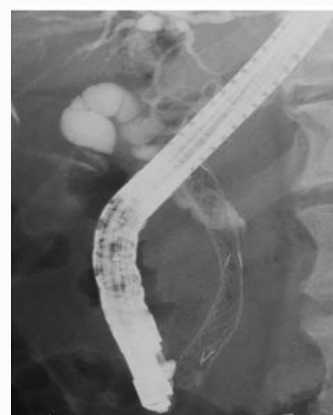
Figure 5: We successfully performed double layer metallic stent placement.

(1/100, 1%) ( P=0.104 ). In addition, stent migration was seen in only FCSEMS group (6.1% vs 0%, P=0.011 ).