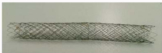
Figure 1: Double bare metal stent (10mm×6cm, EGIS Biliary Stent; S&G Biotech Inc. Korea); Century Medical Inc., Tokyo, Japan).