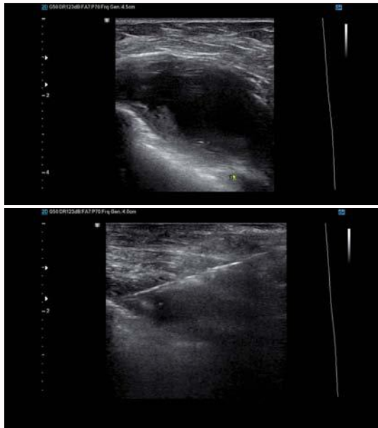
Breast ultra-sound done showed hypoechoic left breast mass 56*45*36 mm.

or malaise. On examination, she had a right lower inner quadrant breast mass measuring 4 by 4 cm with moderate tenderness and cystic consistency. There was nipple retraction and erythema around the mass. She did not have lymphadenopathy. Her other systemic examination were all normal. An impression of a right breast abscess was made and she was taken for an incision and drainage procedure. Samples were taken for microscopy, culture and sensitivity. The cultures turned positive for granulomatous inflammation suspicious of mycobacterium tuberculosis. She was promptly referred to the tropical medicine specialists for initiation of anti TB therapy and follow up. She also continued with dressing changes of the wound which has healed well.