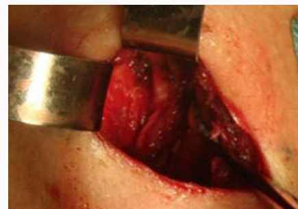
Figure 3: The recurrent laryngeal nerve is identified, typically in the tacheoesophageal groove.

combination of serial retraction and blunt dissection, and with the aid of a detacher. For bilateral subtotal thyroidectomy, the recurrent laryngeal nerve was first identified before dissecting the backside of thyroid gland (Figure 3). All removed tissues were immediately sent for pathological examination (Figure 4). When came across thyroid carcinoma had invade the capsule, we would perform a pretracheal lymph node dissection. The anterior cervical muscle was closed with a simple continuous suture using a 5-0 vicryl suture. The skin was closed with an intradermic suture. A drainage tube with negative pressure suction was placed (Figure 5).