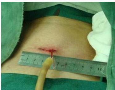
Figure 5: A drainage tube with negative pressure suction after the surgery.

at 4 weeks after operation), and parathyroid function (as reflected by serum calcium at 12-h and 1-w after operation). Postoperative pain was routinely assessed in our clinical practice using a 10-point Visual Analogue Scale (VAS) at 12-h [20] and 1-w. Cosmetic satisfaction was examined and recorded using a 10-point analogue scale at 24-h 12-w by the patients. Hospital stay was also extracted.