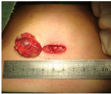
Figure 4: Thyroid lamina delivered through an incision of about 2.5 cm.