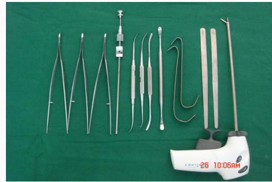
Figure 1: Major instruments for L-MINT.

A cervical incision of 2.5 cm to 3.0 cm was made in the midline, approximately 1.5 cm to 2.0 cm above the sterna notch, and conforming to a preexisting skin crease. The incision was made with the neck mildly extended. Subcutaneous tissues and the platysma muscle were carefully separated starting from the upper edge of incision to the lower edge of thyroid cartilage. The plane between the strap muscle and the thyroid gland was established with a