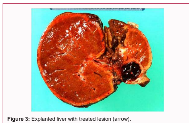
Figure 3: Explanted liver with treated lesion (arrow).

No patient experienced significant decrement in liver function as noted through time of analysis or up through transplant date. There was no indication of RILD in any OLT candidate through most recent