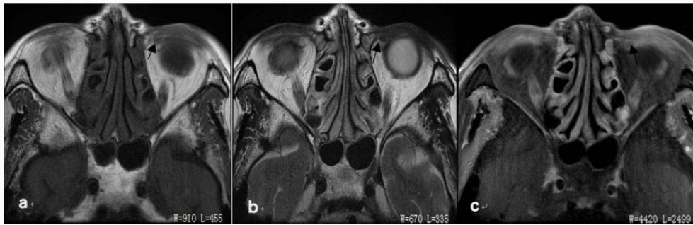
Figure 1a: MRI image of orbit (Transverse section).

(a) (indicated by the arrow) T1 weighted image showed a soybean mass in the left eye area, showing an equal and uniform signal; (b) (indicated by the arrow) T2 weighted image showed an abnormal signal shadow mass in the epicanthus area of the left eye, showing an equal and uniform signal; (c) (arrow) showed no obvious enhancement of the tumor.