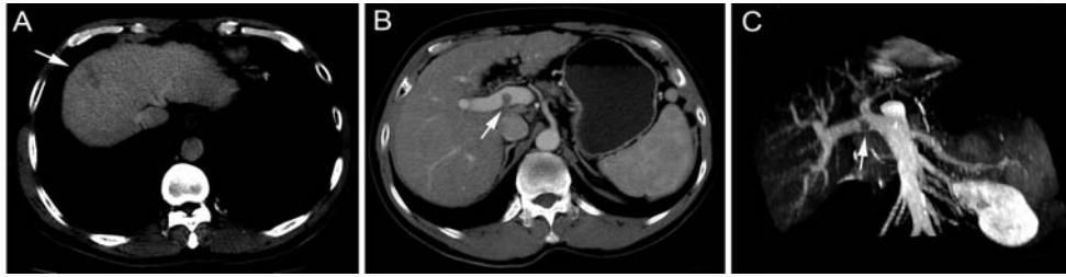
Figure 1: Contrast-enhanced CT scan of hepatic mass and portal vein tumor thrombosis. (A) The hepatic mass at segment VII was indicated by an arrow. (B) The mural thrombosis in the right portal branch was pointed by an arrow. (C) The portal vein thrombosis was shown in the coronal view.